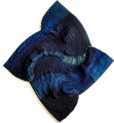
Frank Connet USA "Spiral Square #3" 48" X 44"